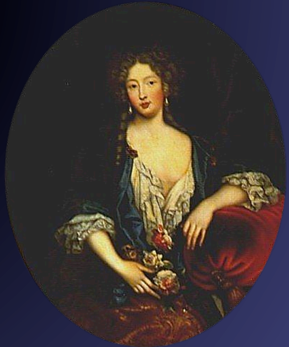
Marie Angélique de Scorailles, one of Louis XIV's many mistresses